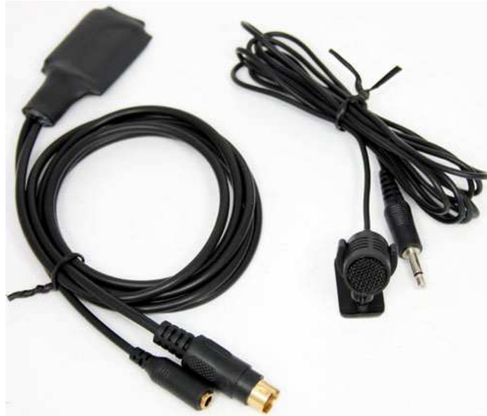
Pic. 1 The GROM Bluetooth Dongle (microphone shape and mount may vary)