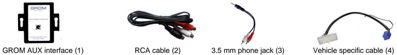
Figure 1. Package content.

a) GROM Audio AUX adapter set consists of GROM AUX interface, RCA cable, 3.5 mm phone jack, and vehicle specific cable (see figure 1).